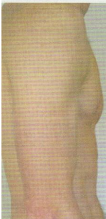
ROUNDED SHOULDER FLAT BACK

Attention to your upper back is less common but the relationship between the large muscles used in climbing and thoracic spine makes climbers